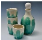
Clarry Hill Pottery 1244 Clarry Hill Rd, Union