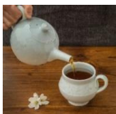
Fireside Pottery 1478 Camden Rd Warren