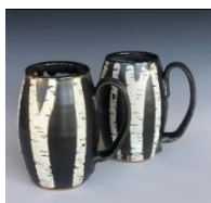
Good Land Pottery 487 Morse Road Montville