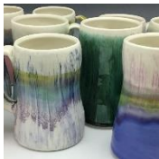
Neighborhood Clay/ Liz Proffetty Ceramics 590 Main St Damariscotta