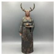
Magic Deery Studio 1147 Peabody Rd, Appleton