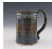
Unity Pond Pottery 222 Bangor Rd Unity