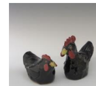
Brooklin Pottery Co-op 24 Mountain Ash Rd Brooklin