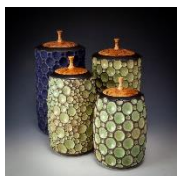
Van der ven Studios 27 Moss Meadow Rd Lincolnton