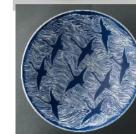
Lansing Wagner 12 Long Farm Rd East Blue Hill