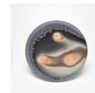
EC Ceramics 68 Popple Lane East Blue Hill