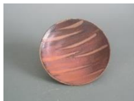
Prescott Hill Pottery 261 Prescott Hill Road Liberty