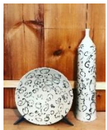
Alexsandra Tomasulo 5 Double Dolphin Way, Walpole