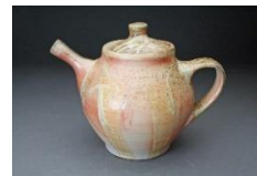
Jody Johnstone Pottery 135 Webster Road Swanville