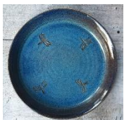
Dragon's Breath Pottery 271 Depot Road, Warren